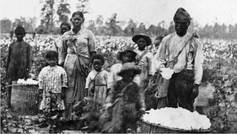
An enslaved family picking cotton in the fields near Savannah, circa 1860s.